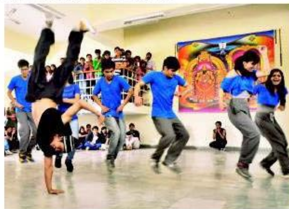
DCAC won the street dance competition