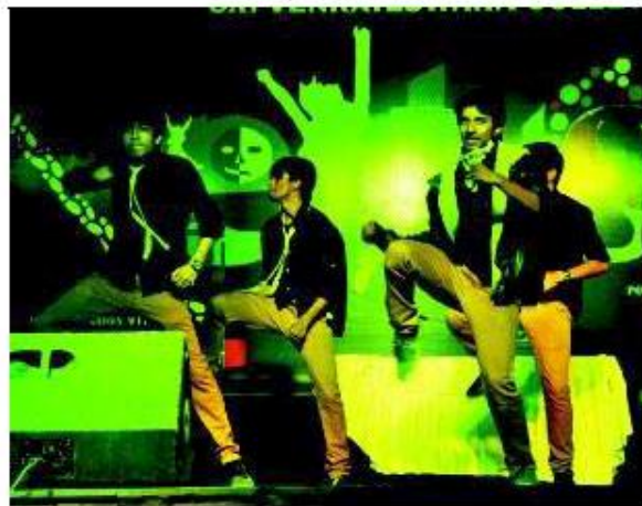
Boys of IIT Delhi took the Western Dance prize with their anti-smoking themed performance