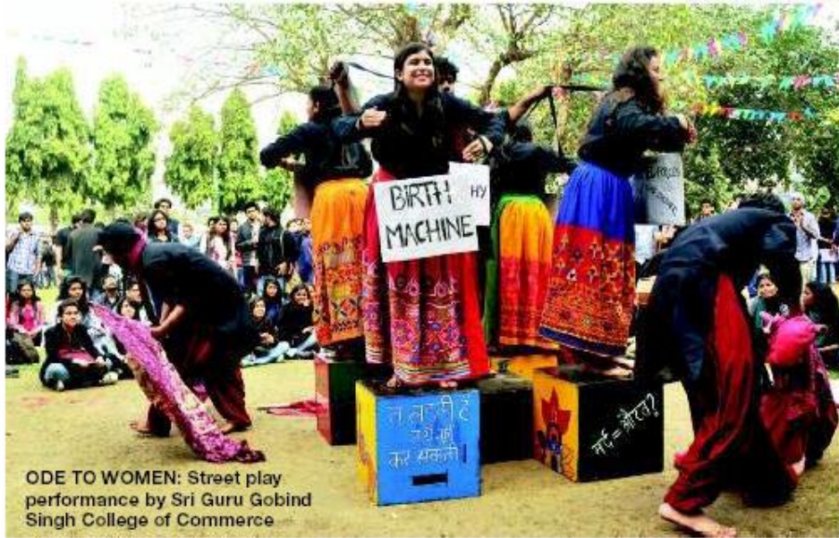
ODE TO WOMEN: Street play performance by Sri Guru Gobind Singh College of Commerce